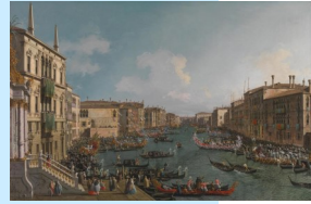
Canaletto 'A regatta on the grand canal'

This week we have held our 'Take One Picture' art week, which is a joint project with the junior school, inspired by the National Gallery. The children have been using the work of Canaletto, an Italian artist. Across both the infant and junior school the children have been concentrating on the skill of painting. There will be an exhibition of the children's work from reception through to year 6 in the junior school hall on Thursday 27th February , straight after school. Please add this date to your diary.