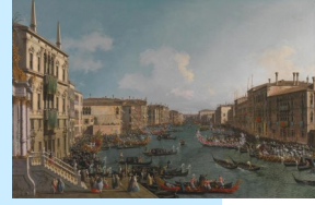
Canaletto 'A regatta on the grand canal'

Yesterday we held our 'Take One Picture' exhibition, where the children's artwork was on display, alongside artwork from the children in the junior school. The children used the work of Canaletto, an Italian artist as their inspiration. It was great to see so many children and adults at the exhibition. Displaying the children's work together demonstrates the skills they have learnt and enables the children to feel proud of what they have achieved. Well done everyone.