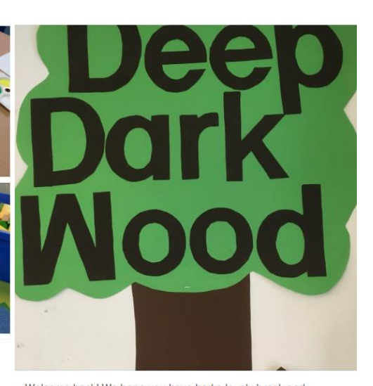
Welcome back! We hope you have had a lovely break and enjoyed the fabulous sunshine.

The adult led activity today will be a writing task. We will write our names, draw a picture of an animal and then write the first sound in the animal's name.