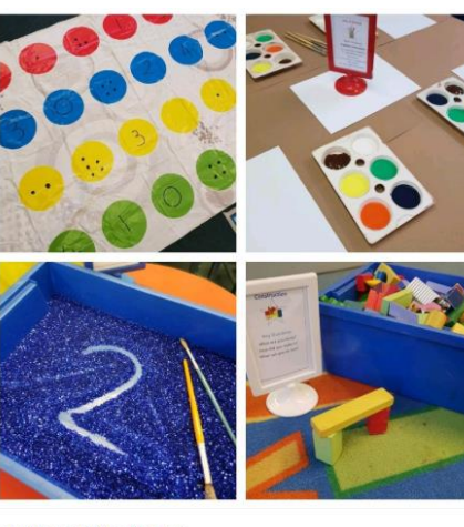
Today's activities include:

See you then and enjoy the rest of your evening.