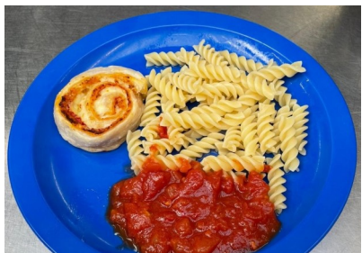
Homemade Cheese & Tomato Pinwheel with Pasta Spirals & Tomato Sauce (optional)