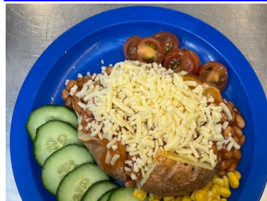
Jacket Potato with a choice of toppings: Cheese/Beans