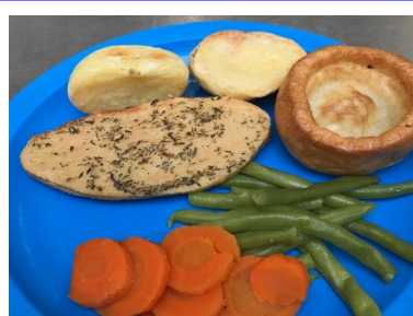
Roast Quorn Fillet with Yorkshire Pudding & Veg (Gravy optional)