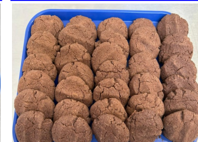
Homemade Chocolate Shortbread Biscuits

A selection of some of the meals that are served on our current menu from October 2023—March 2024.