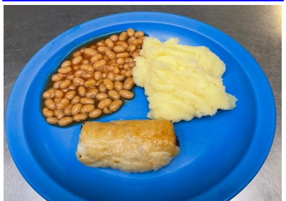
Homemade Pork Sausage Roll with Mashed Potato & Beans