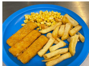
Omega 3 Fish Fingers with Chips & Sweetcorn