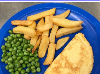
Fluffy Omelette with Chips & Peas