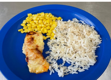
Chicken Italienne (topped with Tomato Paste & Cheese) with Mixed Rice & Sweetcorn