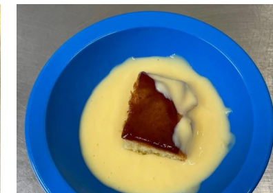
Homemade Jam Sponge Cake with Custard (optional)