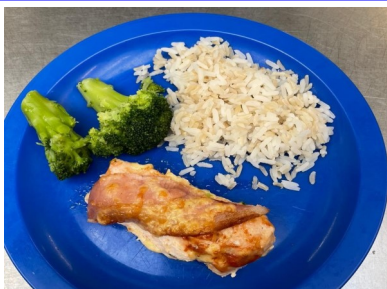
Hunters Chicken (with Bacon & Cheese) with Mixed Rice & Broccoli