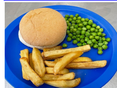
Beef Burger in a Bun with Chips & Peas