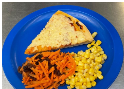
Homemade BBQ Pizza with Carrot & Sultana Salad & Sweetcorn