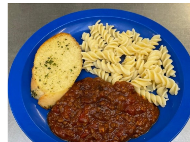
Homemade Beef Pasta Bolognese with Garlic Bread